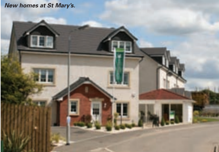
New homes at St Mary's.